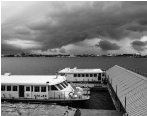
Clouds cover the skyline during the onset of monsoon over Kerala a week later than usual, in Kochi, on Thursday

The Met said conditions were favourable for the monsoon advancing into more parts of the Central Arabian Sea, the rest of Kerala, some more areas of Tamil Nadu, swathes of Karnataka, more parts of the Southwest, Central and Northeast Bay of Bengal, and regions of Northeastern states during